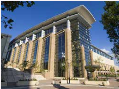
Exhibit Space Costs